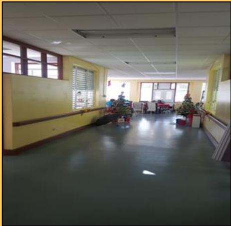
Block 1, Phase I: Completed Refurbishment – Before and After