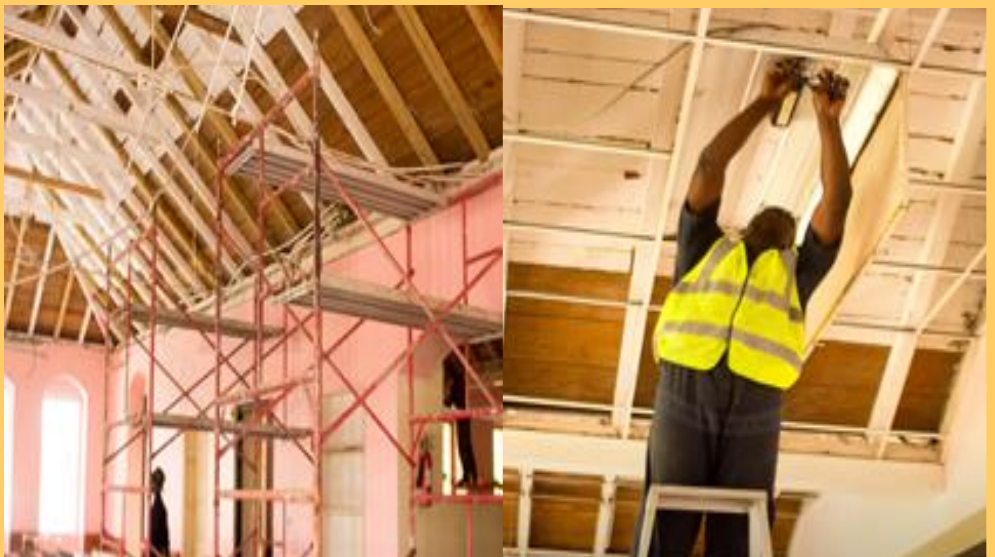
Interior refurbishment roof repairs and electrical works