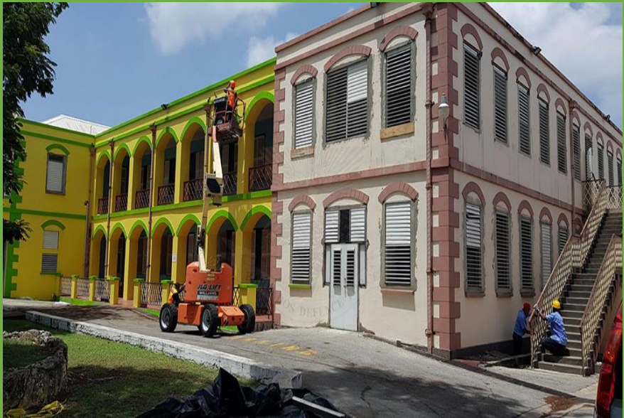
Exterior refurbishment in progress.