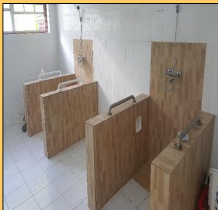
Refurbished Bathroom: Before and After